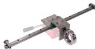
A-0420 (Cutting Guide Compact Without magnet )