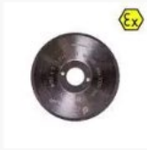
A-0502 - Cutting disc