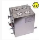
A-0310 Water Control Box