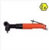
A-0105 Fuji Angle Grinder (FCD-10X-52) (2 PCS)