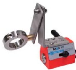
A-0410 Pendulum arm